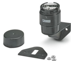
Base for vertical assembly

Please be informed that the data shown in this PDF document is generated from our online catalog. Please find the complete data in the user documentation. Our general terms of use for downloads are valid.