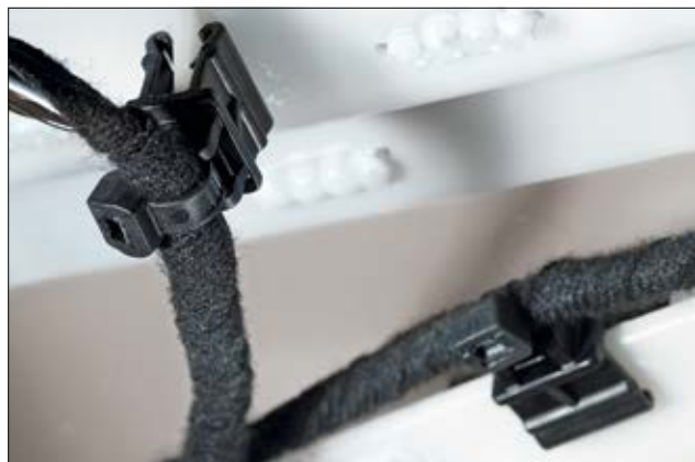
T50ROSEC10 fitted onto a plastic panel to hold a Ø 6 mm harness.