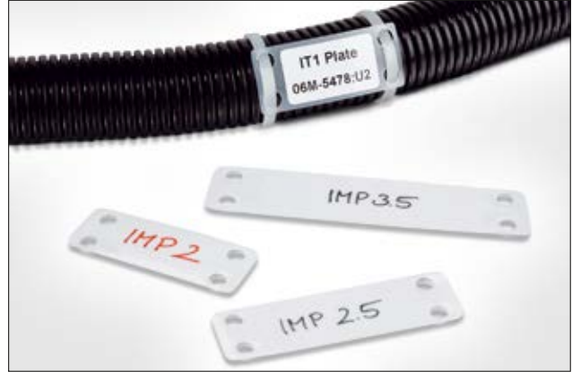
Unlimited cable bundle diameters can be securely identified.