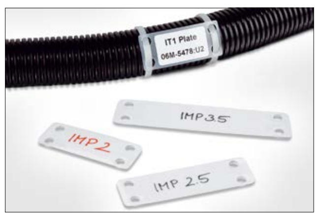
Unlimited cable bundle diameters can be securely identified.