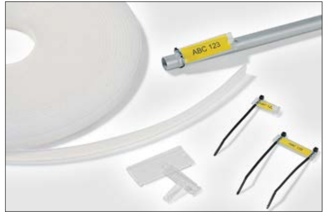
Multi-purpose identification potential: Helafix HC and HCR.